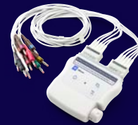
Welch Allyn Wireless Acquisition Module (WAM)