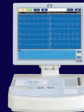
Welch Allyn ELI 380 ECG