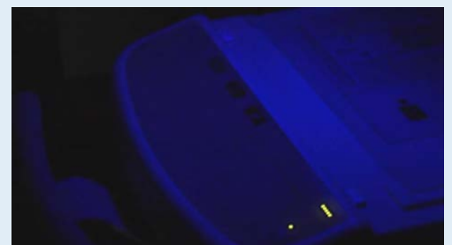
ELI 380 ECG keyboard after cleaning